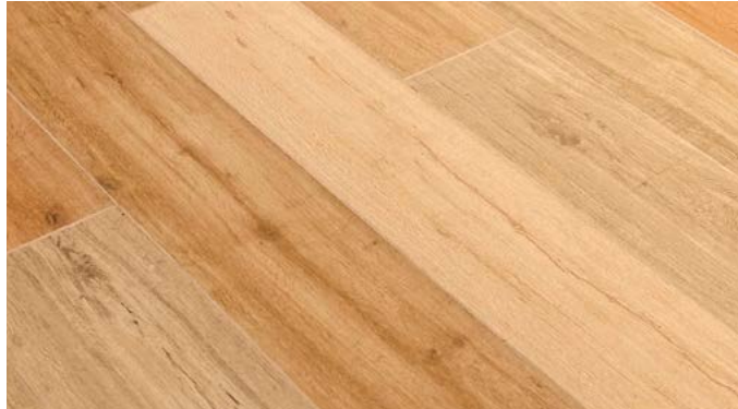
WOOD OR LAMINATE

Easy tap-down glueless installation. Can be installed over wood or laminate, stone or cement, and vinyl or tile.