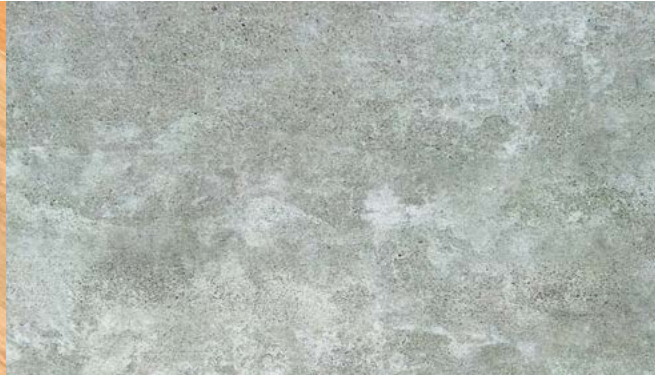
STONE OR CEMENT