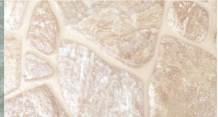
VINYL OR TILE